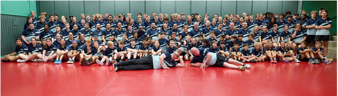
Ängby Summercamp 2022